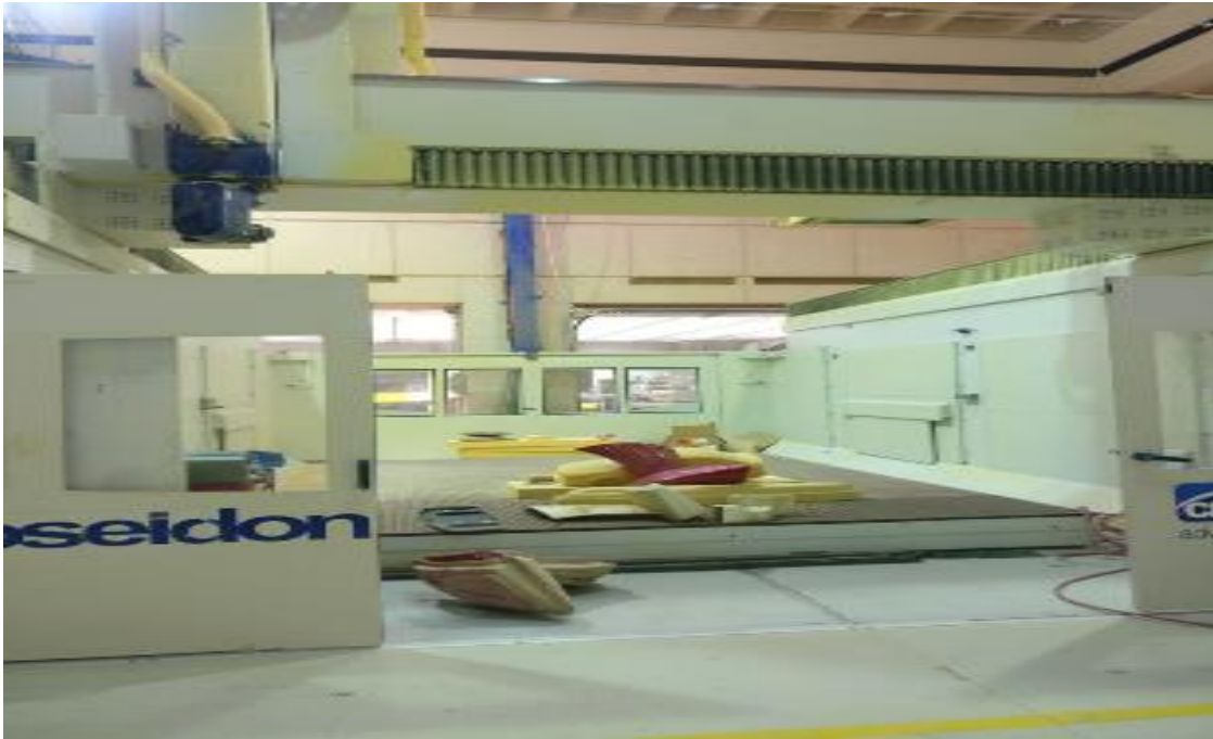
5-axis CNC Milling Machine